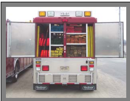
Shown with typical USAR timber compliment

Tractor can vary depending on your requirements and budget. Everything from a 2-door or 4-door commercial to a Spartan custom cab. Horsepower can range from 300 to 500. Command centers are available in the tractor or trailer.