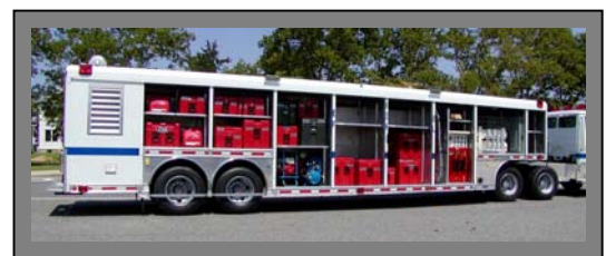
Shown with FEMA pallet loaded cache, 60-kw diesel generator and 26 cfm air compressor