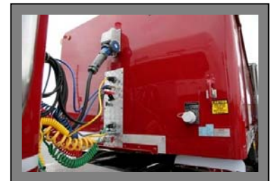
Tractor-to-trailer umbilical connection for DOT, multiplexing, air and generator

Regardless of your departments unique requirements, Hackney has a solution for moving that huge compliment of specialty equipment to the scene. Once there you have all the support ancillary capability that you could ever want in one easy-to-maneuver apparatus. In fact, although some tractor-trailer models can exceed 60-ft in overall length, they can be maneuvered into spaces some 32-ft apparatus can not go.