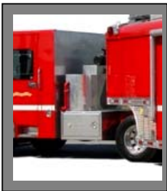
Rotary-screw PTO compressors from 85 to 370 cfm

Regardless of your departments unique requirements, Hackney has a solution for moving that huge compliment of specialty equipment to the scene. Once there you have all the support ancillary capability that you could ever want in one easy-to-maneuver apparatus. In fact, although some tractor-trailer models can exceed 60-ft in overall length, they can be maneuvered into spaces some 32-ft apparatus can not go.