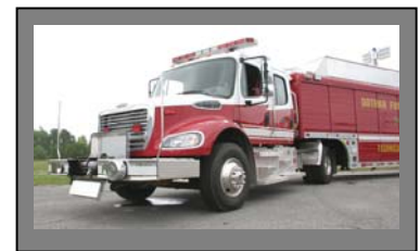
Portable or fixed front bumper winches

Tractor can vary depending on your requirements and budget. Everything from a 2-door or 4-door commercial to a Spartan custom cab. Horsepower can range from 300 to 500. Command centers are available in the tractor or trailer.